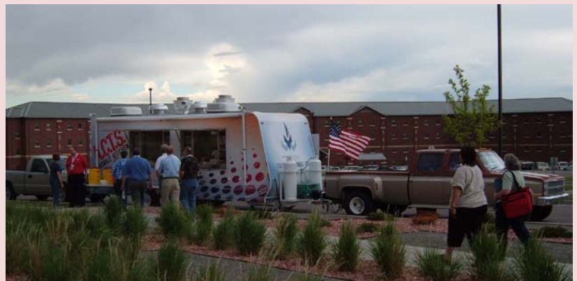
Woodmen Valley Chapel Feeding the ARC