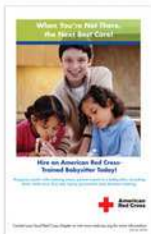
Babysitter's Training Poster #655636 (pk/25)