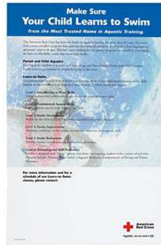
Learn to Swim Poster #651237 (pk/25)