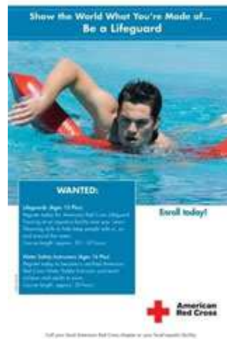
Lifeguard/Water Safety Instructor Poster #654213