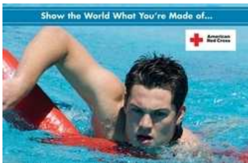
Lifeguard/Water Safety Instructor Recruitment Postcard #654211 (pk/25)